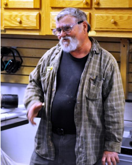
A couple of new members ...